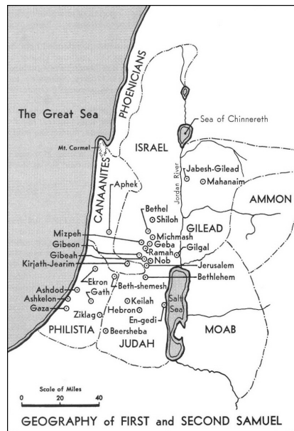
Map of David's Kingdom- ESV Global

Legend: B.C. dates at top of timeline are approximate. Note that 931 BC marks the division of the Kingdom into Southern Tribes (Judah and Benjamin) and Ten Northern Tribes. To avoid confusion be aware that after the division of the Kingdom in 931 BC, the Southern Kingdom is most often designated in Scripture as " Judah " and the Northern Kingdom as " Israel ." Finally, note that 1 Chronicles 1-9 is not identified on the timeline because these chapters are records of genealogy.